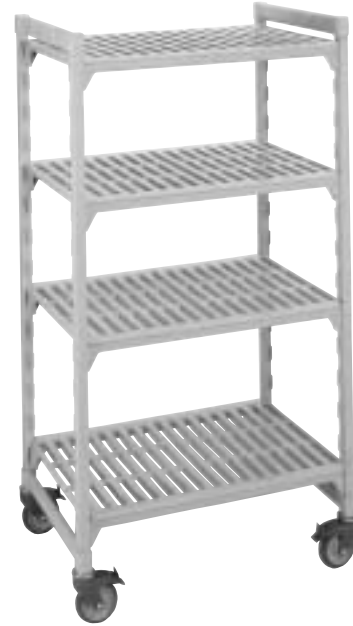
Mobile Camshelving Unit.